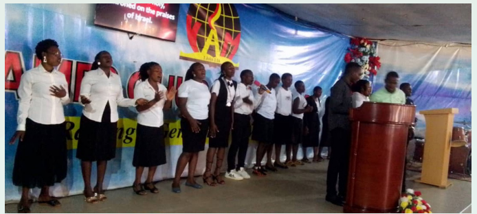
Youth conference in Mbarara Flames Church

As a ministry, God has opened a door for us to preach in the market place. Two banks and one financial service (SACCO) have opened up for us. Equity Bank and UBA and Kakoba Financial services. We carry a portable sound system that helps us do praise and worship and then we share the word of God. The Mbarara City Council has also opened for us every after 3 weeks and the Division Council too.