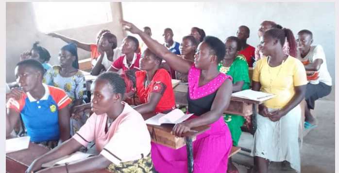
Adult literacy Class Members in one of the lessons