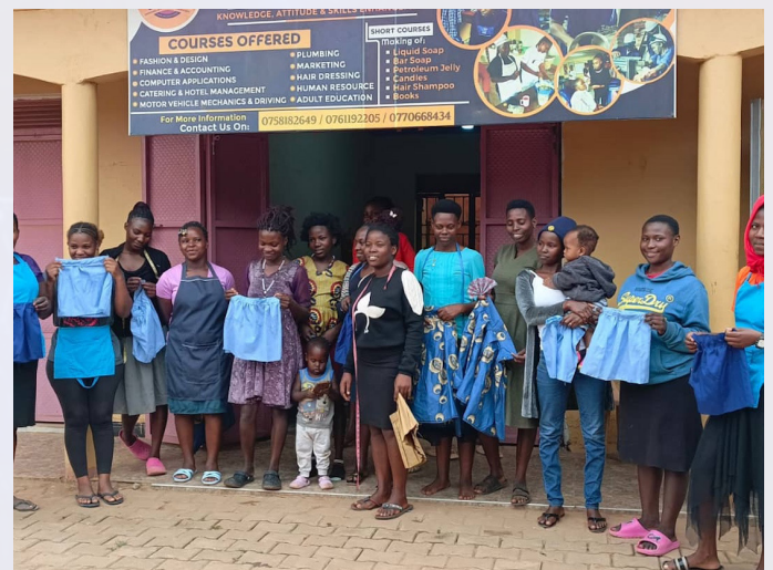
Vocational skills students showing their work