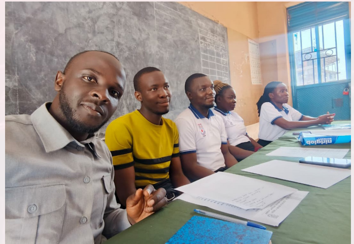
Mercy Highschool staff members in a meeting