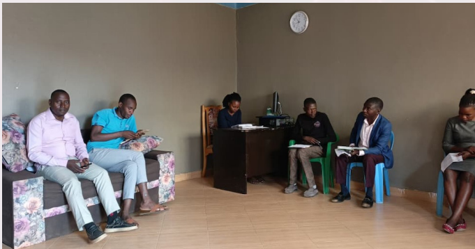
The Missions team holding a meeting