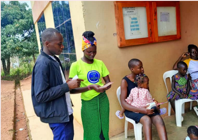
Mission in Masooli - Wakiso District

The monthly support goes to support Mercy Bible Institute, missions office, community volunteers, and Mercy healthcare monthly support.