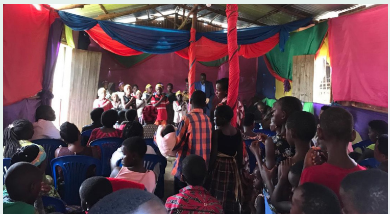
The support visit for Flames Church for Kabira (Isingiro)