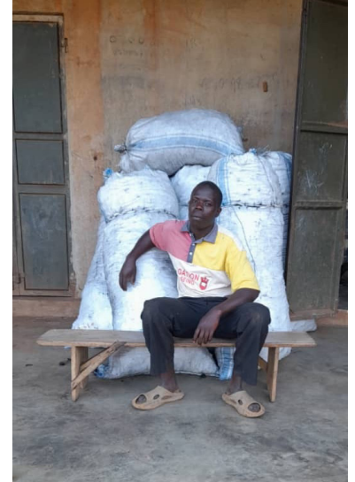
Their businesses in pictures