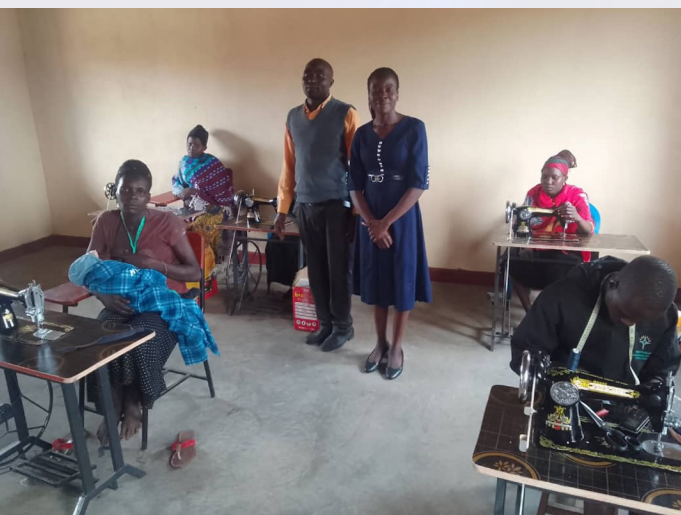
The instructors of Vocational Skills checking on students