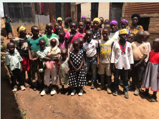
Children Church at Flames Church Kabira